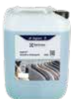
W01 - lagoon® Sensitive Detergent

lagoon® Advanced Care operates with two detergents and one conditioner. Four prespotting, one prebrushing agent, plus an additive to reduce the risk of colour transfer, complement the process.