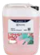
W02 - lagoon® Delicate Detergent