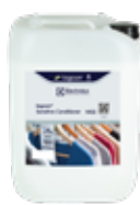
W03 - lagoon® Sensitive Conditioner